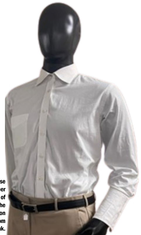
On April 5, students began to raise awareness about the new Career Closet located in the Student of Activities Building, room 213. The Career Closet app was launched on Okta after students returned from Spring Break.