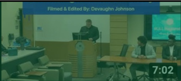
Student Government Union 2022-2023 Executive Board...