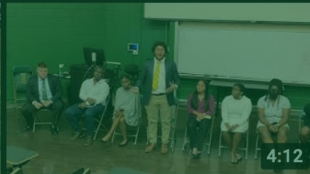
[SGU Elections 2022 | Saint Leo University]