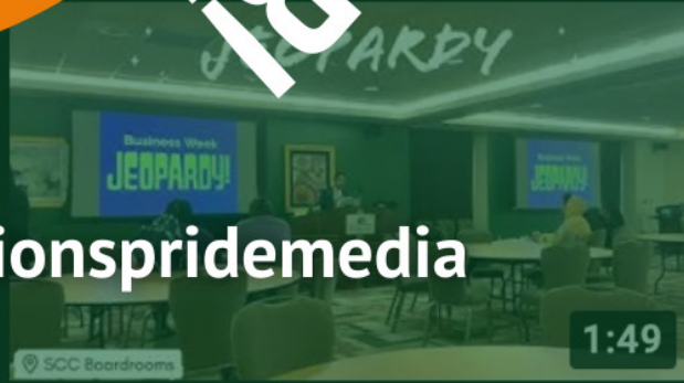
Business Week 2022 - Game Night | Saint Leo University