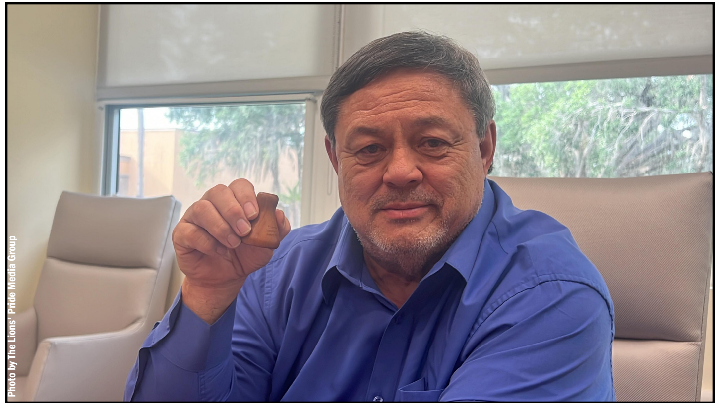
Dadez uses this wooden kaleidoscope as a reminder to always look at issues from all perspectives.

Dadez hopes this temporary disintegration will soon reconstruct into something beautiful in years to come.