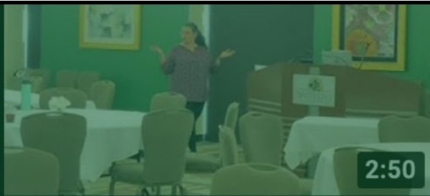
Business Week Awards Ceremony | Saint Leo...