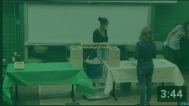
Bridge Building Contest | Saint Leo University