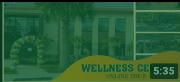
Wellness Center Virtual Tour | Saint Leo University