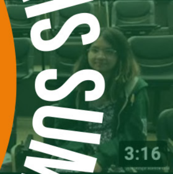
of Animation | University