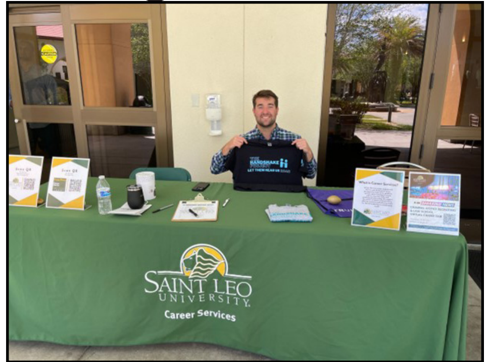
The Career Services department has organized several giveaways with shirts, tumblers, and other items.

"It is challenging to live with a learning disability," said