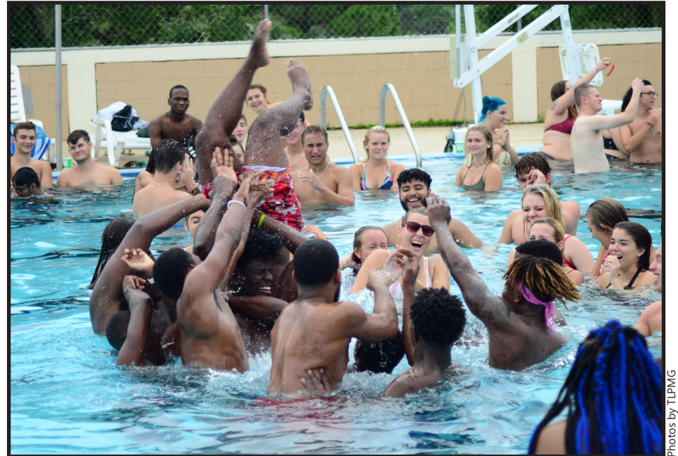
Freshman Orientation allowed many of the 1000+ new students to acclimate to the new environment.

he was about having a ceremony as he believed that they are frequently individual, rather than institutionally centered.