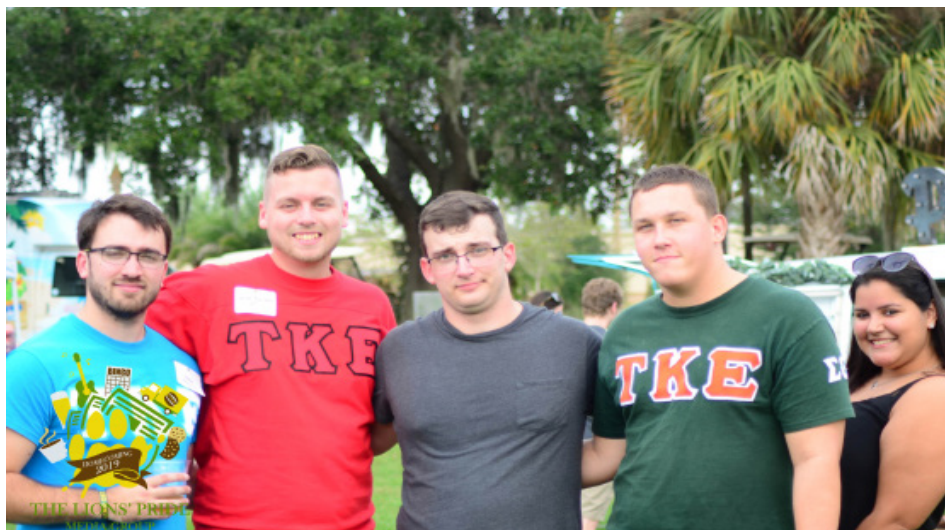
Homecoming Weekend 2019 provided the right event for alumnus to play catch up with friends, some of which had not met up since graduation.