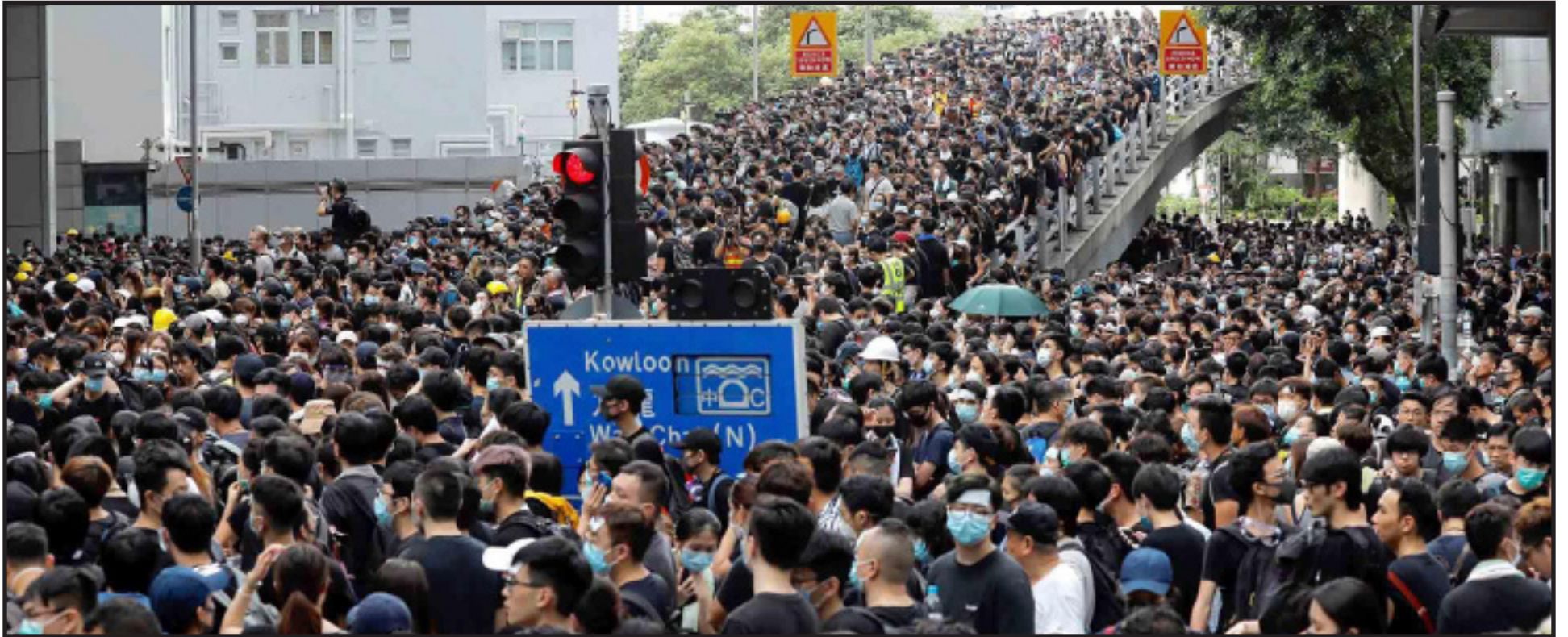
Thousands of Hong Kong residents rally to protest the lack of job opportunities available to them due to immigration influxes and financial crisis.