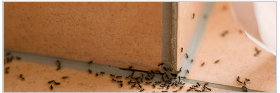
Ants and other bugs continue to be a source of problems for residence of the apartments.

The approach is a holistic one and in approaching it Caban says, “How do we get the masses to understand that it's a community issue, I'm [personally] not a big proponent about pouring chemicals, so just because