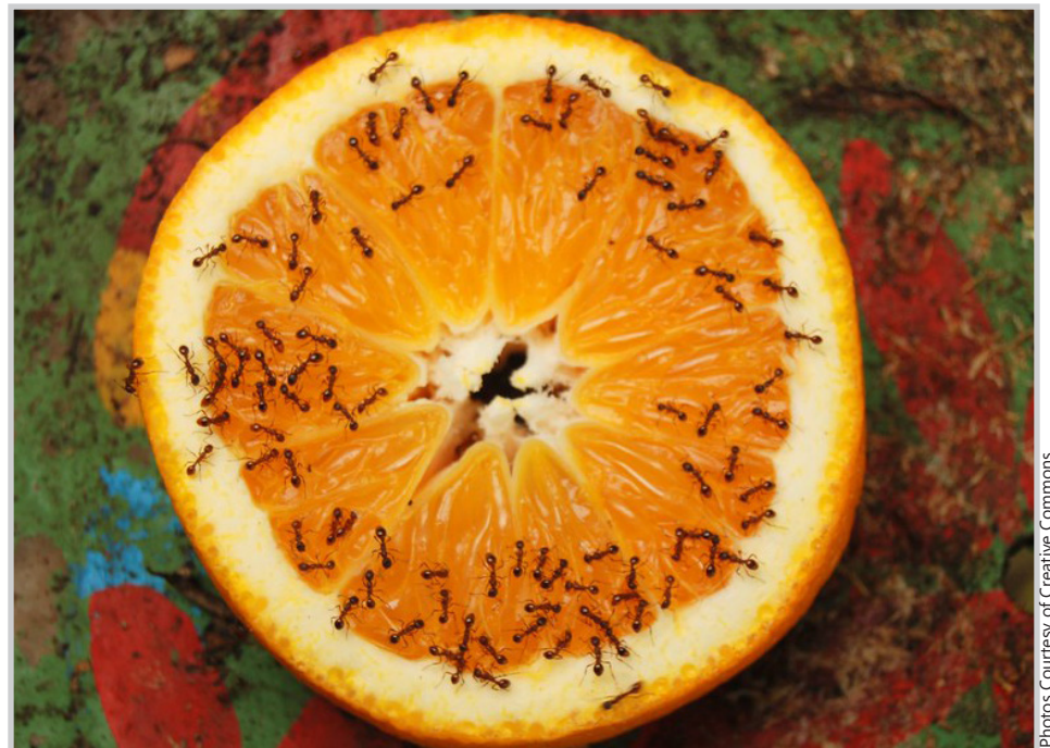
The staff of Facilities Management have found trash within the apartments to be a food source for pests, along with weather changes like constant rain.

As students continue to live in university based housing, it's important that they continue to be conscientious observing core values like Responsible Stewardship. It is imperative that student be accountable for their areas, working with Facilities Management to ensure a safe, sanitary and enjoyable living environment for all.