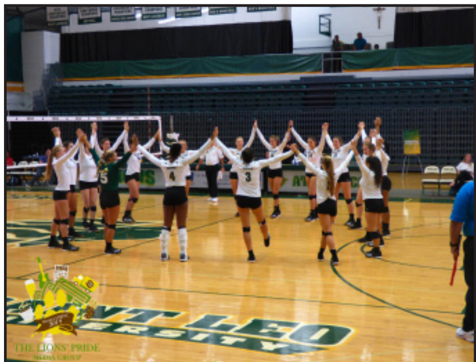
A myriad of home games kept the crowd entertained during Homecoming Weekend.

With Homecoming Weekend 2019 presented attendees with a memorable experience and being recorded in the history books of the University, Hoco 2020 is sure to be impressive.