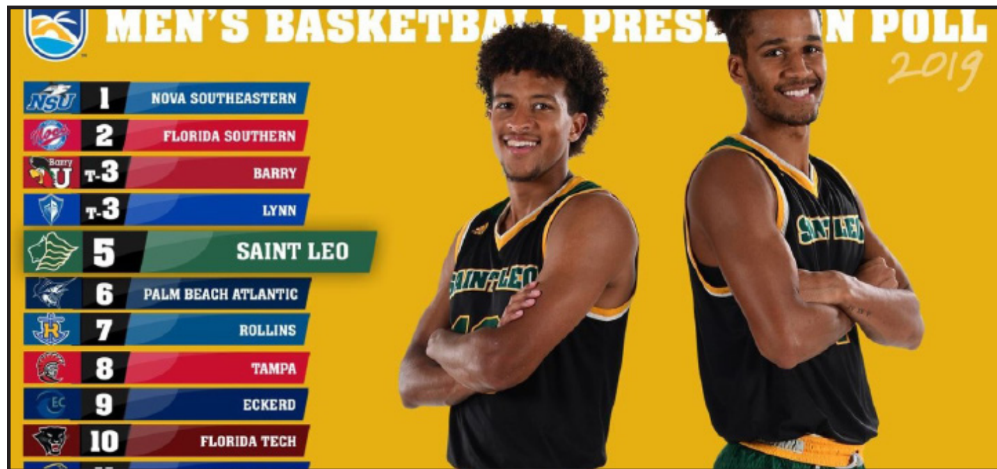
The Saint Leo Lions were picked to finish fifth in the SSC in the preseason poll.