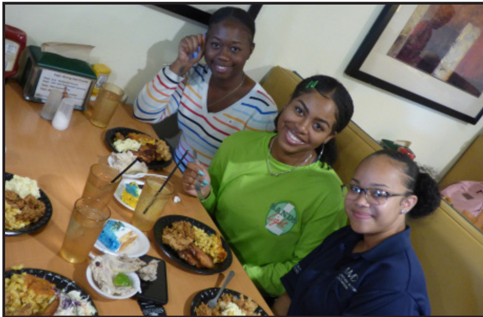
Due to the influx of new students dining services is making an effort to analyze student dining trends to better accommodate student needs

"You accommodate everybody," Brennan said. "You make adjustments. Now at night we're doing the self-serve salad bar which allows the students to make their own salads. I'm still out